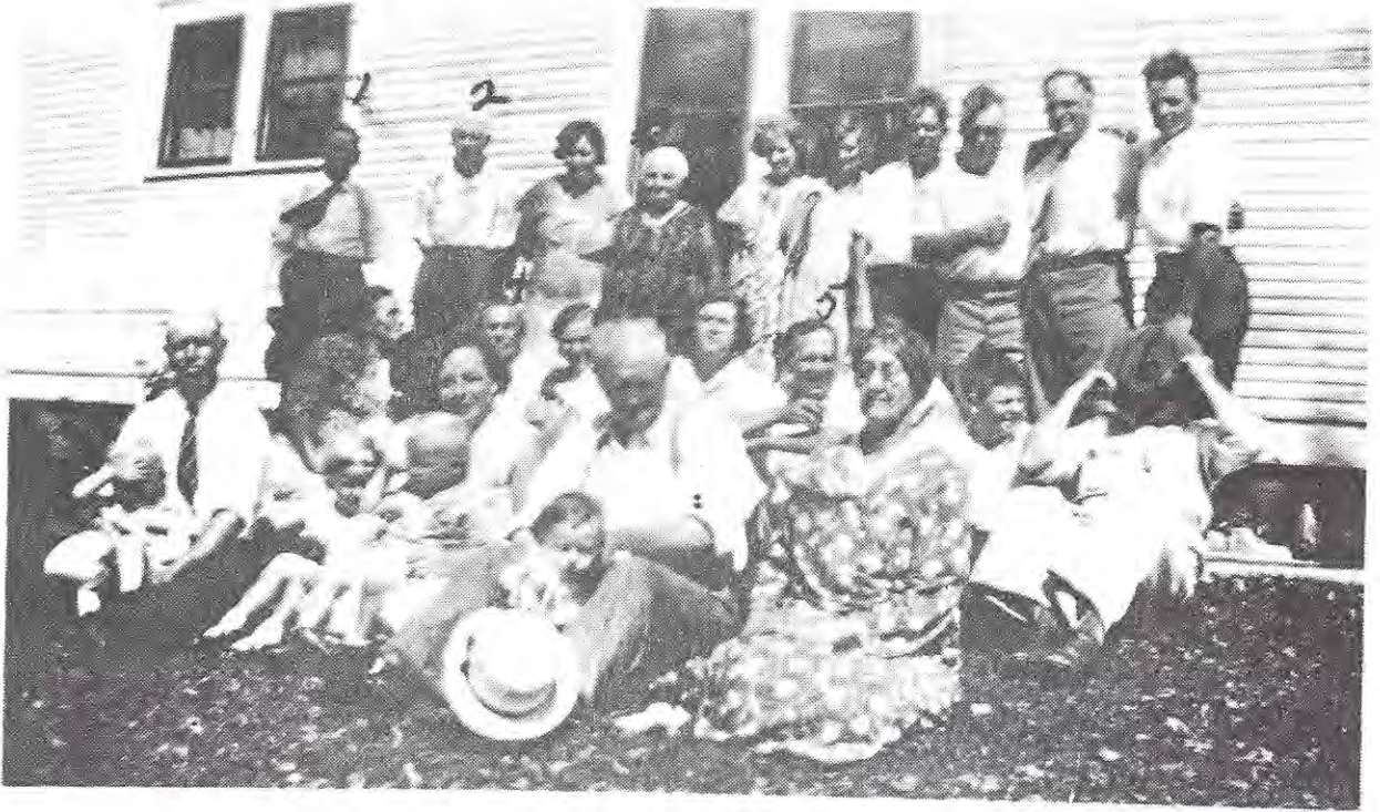
PROB. EARLY 1935 - MAY OR JUNE